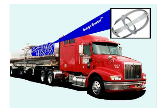
5. Who uses the Surge Buster® system?

Yes, this tie-down system can be installed in all sizes and shapes of tanks – round, elliptical, square and even triangular.